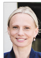
Congresswoman Victoria Spartz

Spartz announced in February that she would not seek a third term in the U.S. House.